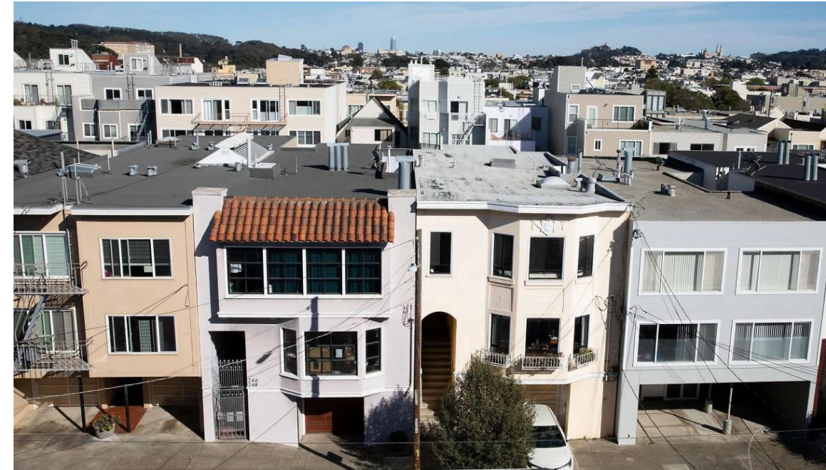
San Francisco residential homes with zero-lot coverage